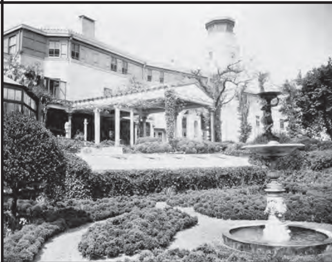
Daffodil Terrace, Laurelton Hall south façade, c. 1925.

Added to the house in 1915 or 1916, the Daffodil Terrace was convenient to the dining room. Open to the surrounding gardens and grounds, it made a graceful transition from inside to outside, integrating the interior of the house with the outdoors and forming a splendid platform for observation and experience of the landscape.