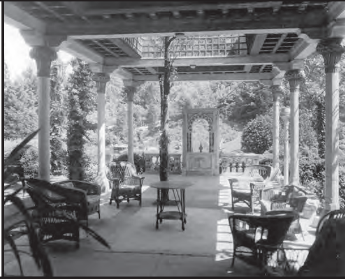
Daffodil Terrace, Laurelton Hall, c. 1925.

floral motifs. These tiles, cast in a composite material of wood fibers and glue from Indian woodwork, are precise down to the wood-grain patterns of the originals.