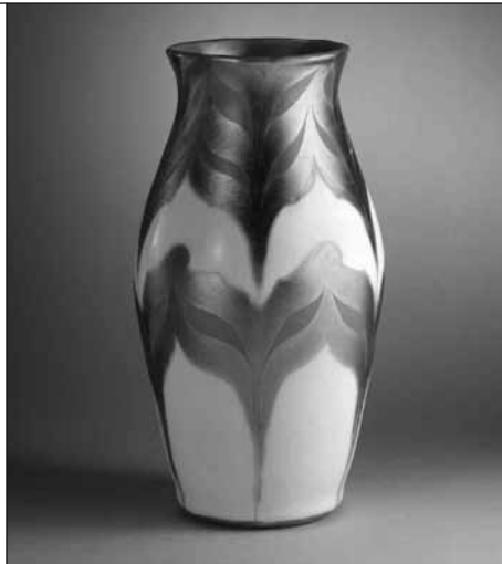
VASE, c. 1902–30. Blown glass (62-019).

Flower holder, c. 1925 No. 159, gold husk base, opalescent tube top Glass, bronze Marks: LOUIS C. TIFFANY FURNACES, INC. / 159 / [LCT conjoined monogram] (66-012)