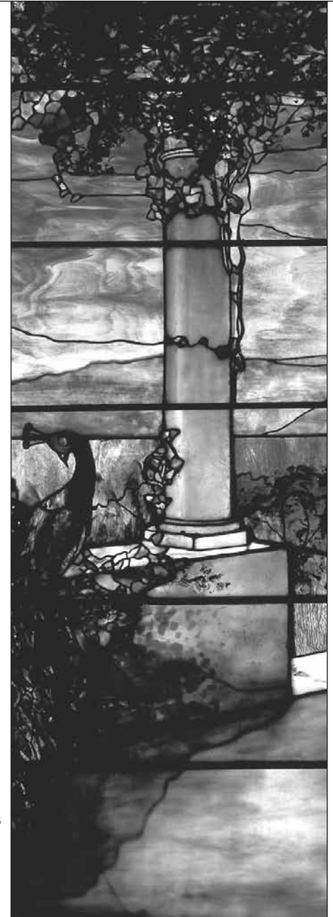
DETAIL, WINDOW, c. 1900–1910. Landscape with peacock and peonies. Leaded glass (75-014).

Landscape with peacock and peonies Leaded glass (75-014)