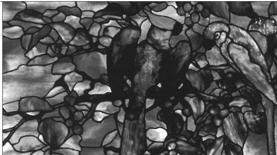
TRANSOM FROM THE WILLIAM WATTS SHERMAN HOUSE, NEWPORT, RHODE ISLAND, c. 1905 Parrots, leaded glass (68-005).

Laurelton Hall, Cold Spring Harbor, New York Plaster, glass (57-021:C & O)