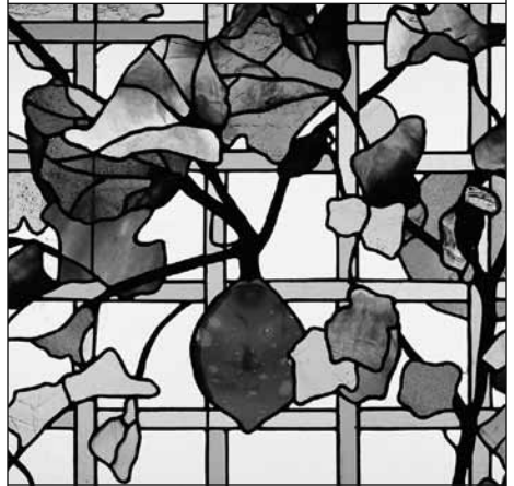
DETAIL, TRANSOM FROM THE GEORGE KEMP HOUSE, NEW YORK CITY, c. 1879. Squash, leaded glass (71-006).

Laurelton Hall, Cold Spring Harbor, New York Leaded glass (78-0139, 140:C, E, F, G, I, J, & K)