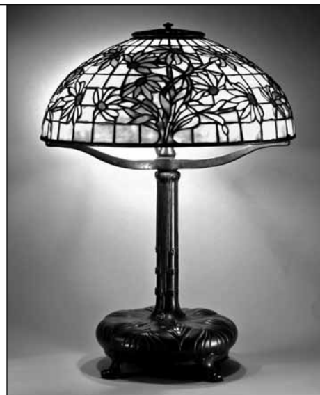
BLACK-EYED SUSAN LIBRARY LAMP, c. 1910. Leaded glass and bronze, (70-028).

Fountain on north terrace, Laurelton Hall, Cold Spring Harbor, New York (2004-022)