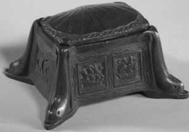
INKSTAND, c. 1905–30. No. 1842, Nautical pattern, bronze (77-008).

No. 1094, Bookmark pattern, small Bronze Marks: TIFFANY STUDIOS / NEW YORK / 1094 (85-002)