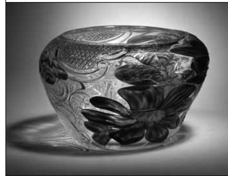
BOWL, c. 1897. Cut and engraved blown glass (64-031).

Bowl, c. 1919 Aquamarine Blown glass Marks: 1335 N Louis C. Tiffany. Favrite – Special Exhibit (67-011)