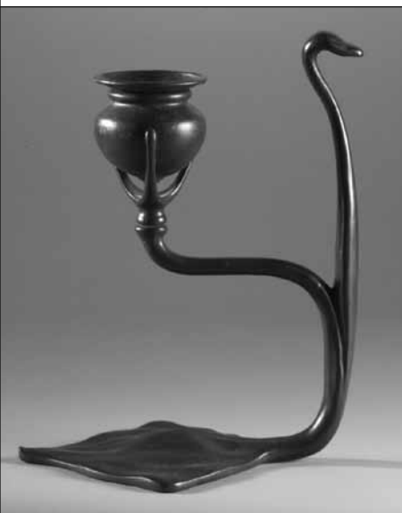
CANDLESTICK, after 1902. No. 1203 A, one light, Leaf design; all metal tripod top (54-101).

No. 1213 A, one light, plain base, tall, all metal tripod top Bronze Marks: TIFFANY STUDIOS / NEW YORK / 1213 (U-022:2)