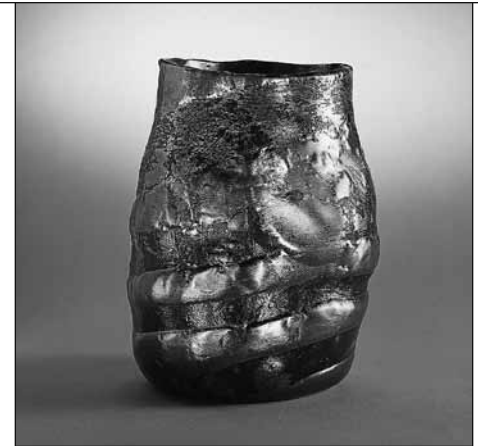
LAVA VASE, c. 1914. Blown glass (65-029).

Vase, c. 1914–15 Exhibited: Panama-Pacific International Exposition, San Francisco, 1915 Aquamarine Blown glass Marks: 5399 M L.C. Tiffany Inc. Favrite – Panama-Pacific Ex 11 (62-005)