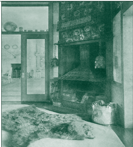
Smoking room, Laurelton Hall, c. 1922.